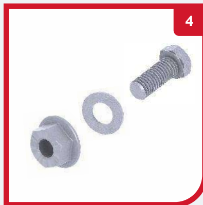
FIXING SET CT AC 615