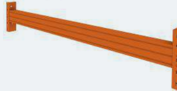
Pallet racking LNS beams