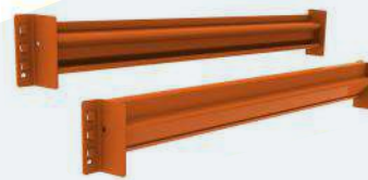
Long span beams