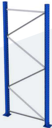
Pallet racking frames